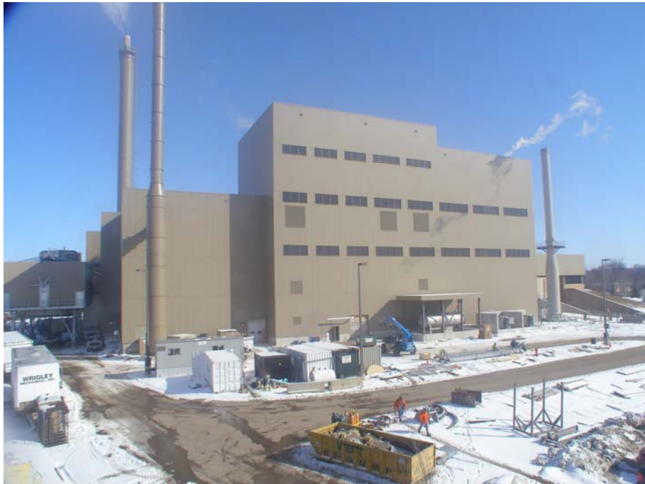
Expansion of the OWEF Building

As population grows in Olmsted and Dodge County, so does the amount of garbage. The amount of garbage in both counties is more than can be processed at the OWEF. Therefore, some of the garbage has been diverted to the Olmsted Landfill. To reduce landfilling and prepare for future growth, Olmsted County has recently doubled the size of the OWEF to provide processing capacity for Dodge and Olmsted waste for the next 20 years. The cost of the construction is about $90 million. According to the Dodge/Olmsted Waste Management Agreement, Dodge County is responsible to pay Olmsted County for the cost of processing Dodge County waste.