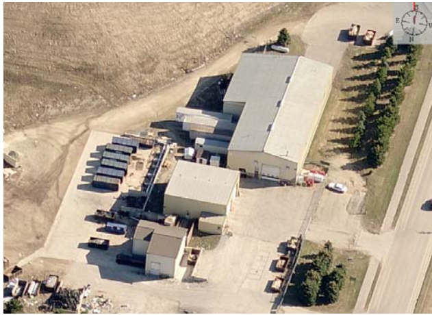
Dodge County Transfer Station