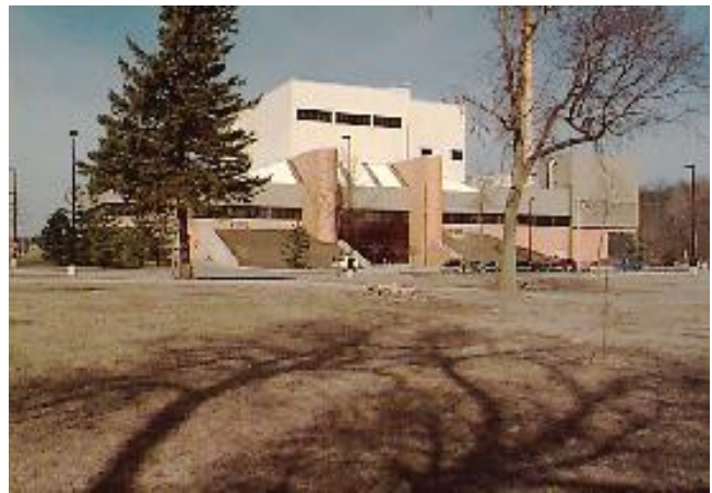
Olmsted Waste-to-Energy Facility (OWEF)

1. How does Dodge County dispose of my waste? Since 1986, Dodge has partnered with Olmsted County to build and operate a waste management system that uses garbage to generate renewable energy. Garbage is delivered to the Transfer Station then transported to the Olmsted Waste-to-Energy Facility (OWEF) for production of steam and electricity. All the expenses for this system are paid by user fees.